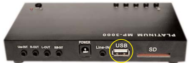
(back of MP-3000)

For further assistance, contact Info-Hold at 1-800-373-8200