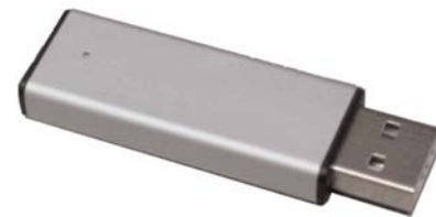
(USB flash drive)